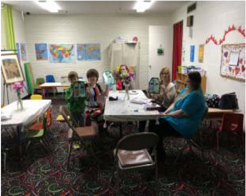
Sunday School - "Creation Station"