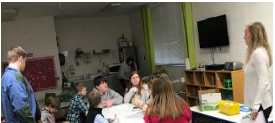
Sunday School - "Let Us Play"