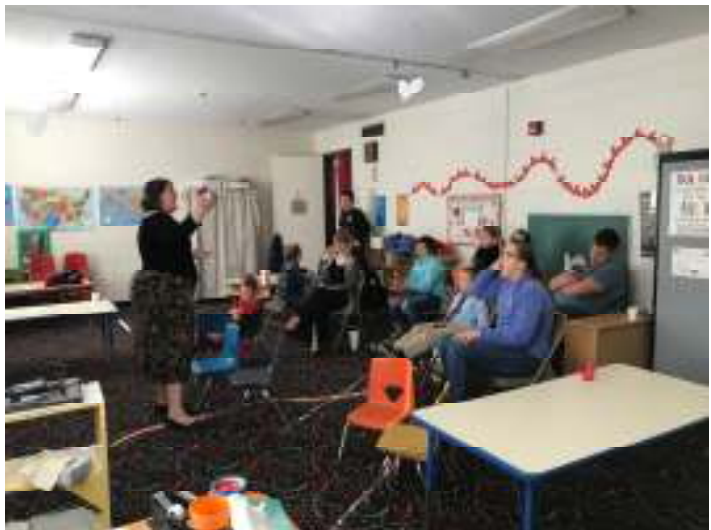
Sunday School - "HolyWord Theater"